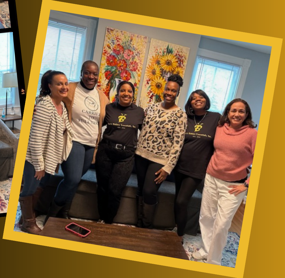
Site visit to Carried to Full Term, Haymarket, VA (Nov 15, 2022)